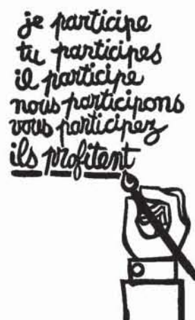
FIGURE 1 French Student Poster. In English, I participate; you participate; he participates; we participate; you participate . . . They profit.

There is a critical difference between going through the empty ritual of participation and having the real power needed to affect the outcome of the process. This difference is brilliantly capsulized in a poster painted last spring by the French students to explain the student-worker rebellion. 2 (See Figure 1.) The poster highlights the fundamental point that participation without redistribution of power is an empty and frustrating process for the powerless. It allows the power-holders to claim that all sides were considered, but makes it possible for only some of those sides to benefit. It maintains the status quo. Essentially, it is what has